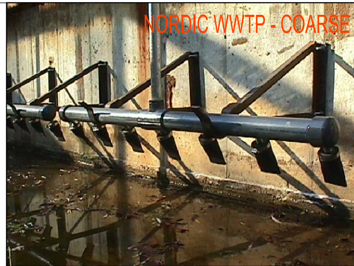
NORDIC WWTP - COARSE BUBBLE RETROFIT MANIFOLDS