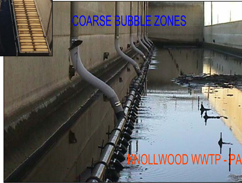
KNOLLWOOD WWTP - PARKSON PANEL REPLACEMENT