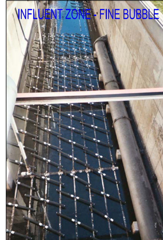
INFLUENT ZONE - FINE BUBBLE